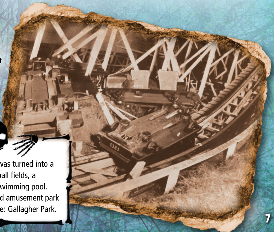
The Big Dipper after the accident

In 1955, Krug Park was turned into a city park with baseball fields, a playground, and a swimming pool. The once-abandoned amusement park also got a new name: Gallagher Park.