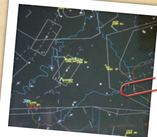
Radar screens display the positions of planes in flight.