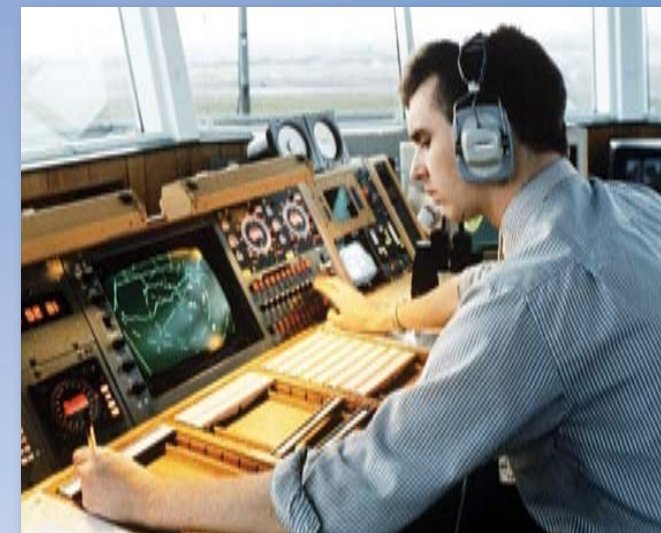
An air traffic controller watches the movements of planes on his computer.

Alan looked back at his radar screen. Something was wrong. Where the plane had been, there were now several objects moving quickly apart. Pan Am Flight 103 had exploded!