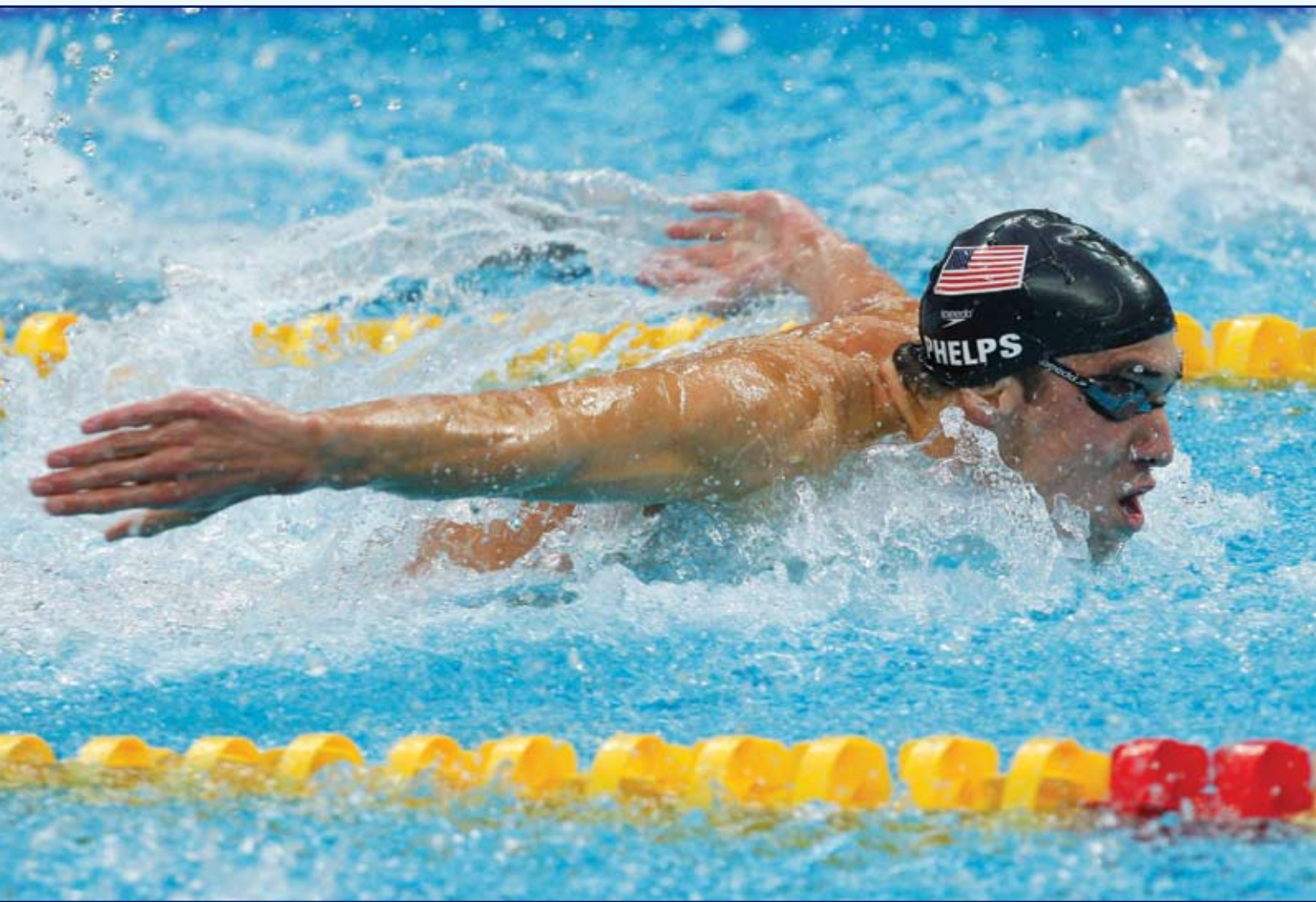
Michael cut through the water with amazing speed in his part of the relay race.

Michael Phelps shot through the water like a bullet through the air. If the U.S. Olympic swim team won this 4 x 100-meter medley relay , Michael would get another gold medal. He had already won seven. Another one would break American swimmer Mark Spitz's 1972 record. Spitz had won seven gold medals—the most ever at a single Olympics.